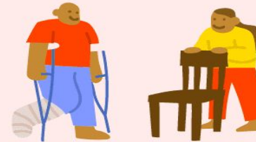
7. Using manners