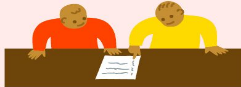
4. Following directions