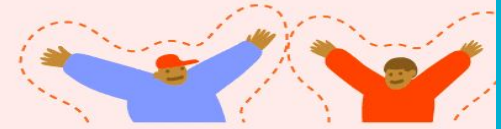
5. Respecting personal space